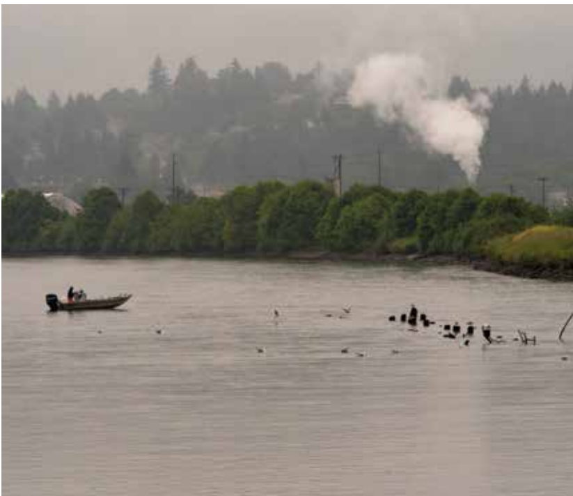
D. Preston (4)